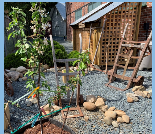
Several improvements have been made to the grounds