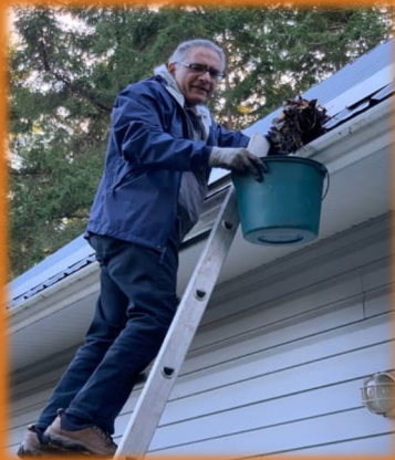
Yours truly, cleaning the gutters.