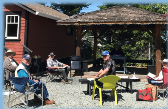
QBH&MS Board Meeting May 2020

QBH&MS board had its first meeting on May 7, after cancelling for two months due to COVID. We had the meeting outside and practiced social distancing while we discussed museum business.