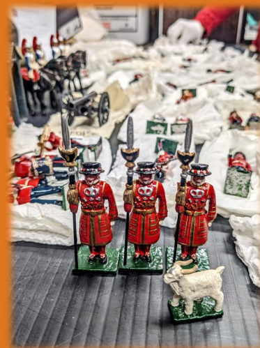
Soldiers and the Goat getting prepped for storage

Through this winter, we've been getting the chance to focus our attention on the collection. We recently received an exciting donation to our display collection—a group of toy soldiers! We counted 107 pieces, with soldiers in various uniforms ranging across the early 20th century, and accessories such as cannons, horses, bicycles, and even a goat! Each item has been meticulously hand-painted and well looked after. We look forward to displaying them in the future!