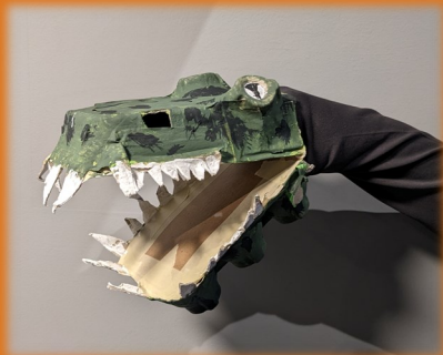
Elasmosaurus puppet made with the QFN kids group

One of the big things we've also been busy with is school and community tours. The museum has