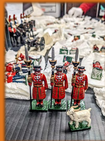
Soldiers and the Goat getting prepped for storage

Through this winter, we've been getting the chance to focus our attention on the collection. We recently received an exciting donation to our display collection—a group of toy soldiers! We counted 107 pieces, with soldiers in various uniforms ranging across the early 20th century, and accessories such as cannons, horses, bicycles, and even a goat! Each item has been meticulously hand-painted and well looked after. We look forward to displaying them in the future!