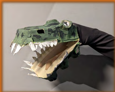
Elasmosaurus puppet made with the QFN kids group

One of the big things we've also been busy with is school and community tours. The museum has