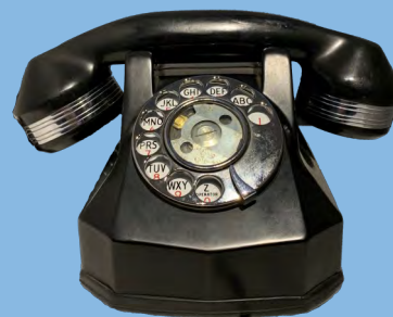
1940's era rotary phone on display - still in perfect working order.