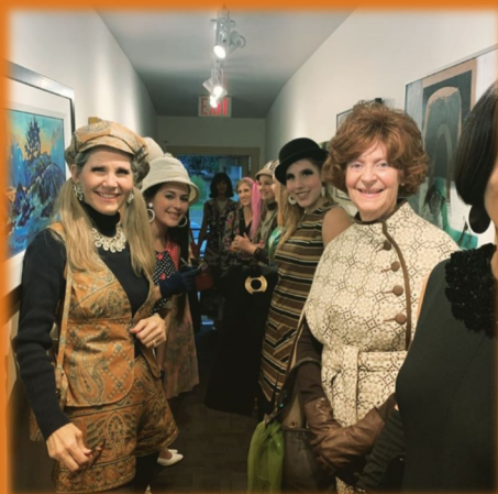
Celebrating retro-fashion-Tea @ TOSH