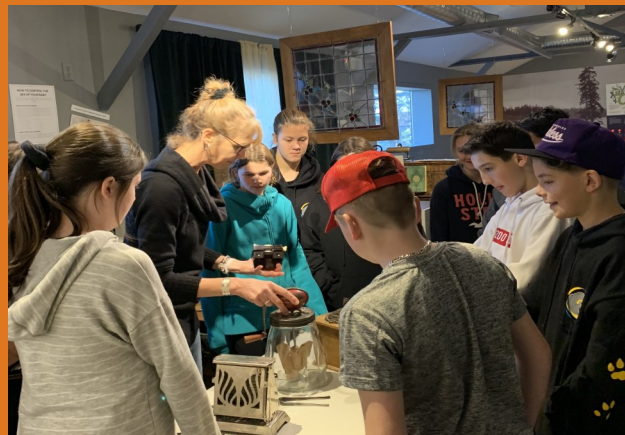
"Guess the artefact" or "Devine quel est cet artefact"

We enjoyed the visit of local French Immersion students and their teachers Mmes Preston and Tanner from École Oceanside. Netanja facilitated the French language learning activities and the students also had a chance to experience the Our Living Languages exhibit. We are currently learning more about how to develop object-based activities for language learners. There are some really fun and engaging ways to help students make important connections between language and culture when they visit the museum.